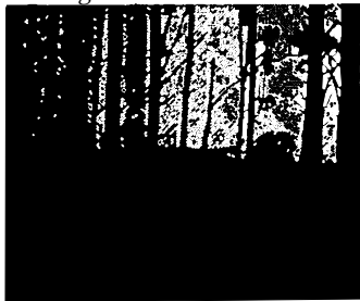
Apache County offers spectacular views and sunsets.